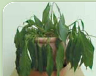
A very sad plant 2 nd Nov. 2012