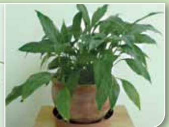
A very happy plant 5 th Nov. 2012

Humans, like plants, need water and nutrition to survive.